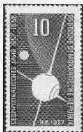
E. Germany 370