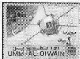
Umm Al Qiwain Mi95