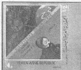
Yemen Arab Rep. Mi910