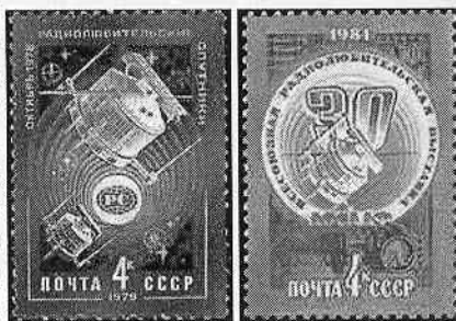
Figure 3 - Russia 4733 (left) and 4917

The next stamp (860) issued by Peru in 1985 shows OSCAR-8, another Phase-2 satellite that was launched in the late 1970s. Then in 1991 Argentina issued a stamp (B157) to commemorate their amateur radio satellite, LUSat or