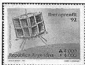
Figure 5 - Argentina B157

Card also contains a postal cancel that shows the Technion satellite. The same cancel is also available on a cover issued at the same time. In 2000 Guyana issued a souvenir sheet of 6 stamps (3502) showing two amateur radio satellites, OSCAR-13 and OSCAR-24, American-built and French-built satellites respectively. And finally, in 2002 Somalia issued a miniature sheet containing only one stamp (new issue, catalog number yet unknown) showing Uribyol, which is another name for three Korean-built amateur satellites also called Kitsat, two of which were given OSCAR numbers, OSCAR-23 or OSCAR-25 and were launched in 1992 and 1993 respectively.