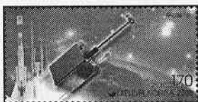
Figure 7 - South Korea 1976f