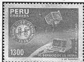
Figure 4 - Peru 860

More-recent postal items include a Souvenir Leaf (or Souvenir Card) issued by Israel in 1995 showing their contribution to the amateur satellite line, Technion or OSCAR-32. The Souvenir