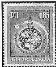
Figure 1 - Yugoslavia 809

Only about ten postage stamps have been issued specifically showing amateur radio satellites, that is out of the less than 100 stamps that have been issued for all aspects of amateur radio. As a reminder for readers, this series of articles is concerned with satellites on postal items such as stamps, souvenir sheets, aerogrammes, postal cards, meters, and cancels, but not with launch covers for these satellites, although images of many of those covers are included in the authors' Website.