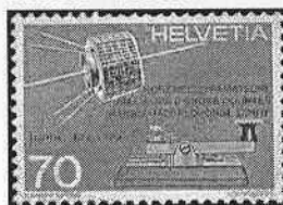
Figure 2 - Switzerland 679

The first stamp showing a satellite on an amateur radio stamp was issued by Yugoslavia (809, Scott catalog numbers used throughout) in 1966. However the satellite shown is not a real satellite. Rather, it is probably the stamp designer's concept or vision of a satellite, a fantasy satellite, since its appearance does not match any known satellites launched up through that year.