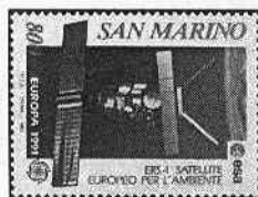
San Marino 1224

Portugal (Madeira) 151 fdc Cancel on FDC 1991 ERS-1