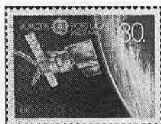
Portugal (Madeira) 151

Portugal (Madeira) 151 Part of SS4 (152 (2x(151,152a))) 1991 ERS-1