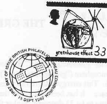
Fig 1. Great Britain FDC. Note that this reproduction is reduced to 80% of full size.

A fragile ecology to bolster and heat, our children's future at stake if we fail.