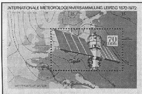
Meteor Satellites Have Two Solar Panels German Democratic Republic (Scott 1364)

Another 4-channel microwave sounding instrument at even lower resolution sends down data for use in cloudy situations where infrared measurements are unable to measure below the clouds.