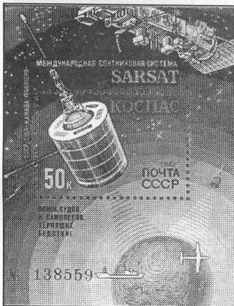
SARSAT and COSPAS Satellites Russia (Scott 5603)

In the United States, the current-series