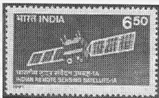
Indian Remote Sensing Satellite India ( Scott 1352 )

The most recent polar-orbiting satellite belonging to the People's Republic of China is FY-1B, launched in 1990. This is China's second polar-orbiting weather satellite, a follow-on to FY-1A launched in 1988. FY is the acronym for Feng-Yun or wind-cloud. Neither satellite is providing operational weather images nor usable data at this time. China's next polar-orbiting satellite, FY-1C, is expected to be launched in 1998. It will carry a multi-channel (visible and infrared) imager, but no sounding instrument. No postage stamps are known to show any of the Chinese FY-series of weather satellites.