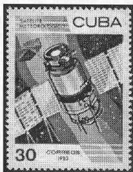
Meteor Polar-Orbiting Satellite Cuba ( Scott 2587 )

Meteor satellites are featured on 18 known postage stamps, listed in the table at the end of this article. In 1983 Cuba issued one of the many stamps ( Scott 2587 ), most from former Soviet block countries, featuring the extensive three generations of Meteor satellites begun in 1969. A miniature sheet issued by East Germany in 1972 ( Scott 1364 ) gives the best representation of a Meteor satellite on a stamp. All Meteor satellites have two symmetric solar panels, one on each side of the main cylindrical satellite body. A small umbrella-like antenna is also a feature on nearly every stamp showing a Meteor satellite. The basic design has changed only slightly over the years when new generations of Meteor satellites were introduced.