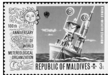
3 – 3 L - the 3 R value has the same design