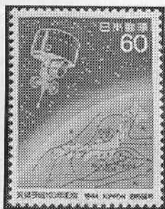
Himawari (Sunflower) Satellite Japan (Scott 1564)

In 1984 Japan issued the best representa-