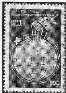
Indian National Satellite India (Scott 1020)

tion of GMC on a stamp (Scott 1564). A total of four known GMC stamps are listed in the table at the end of this article.