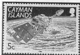
Three-Axis Stabilized Satellite Cayman Islands ( Scott 628 )