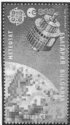
Meteostat Weather Satellite Bulgaria (Scott 3612)

infrared band and one water vapor band, each at 5 km resolution. Meteostats were the first satellites to provide a geostationary view of atmospheric water vapor associated with upper air currents. Such images are quite valuable to forecasters and as input to computer models of the global atmospheric circulation.